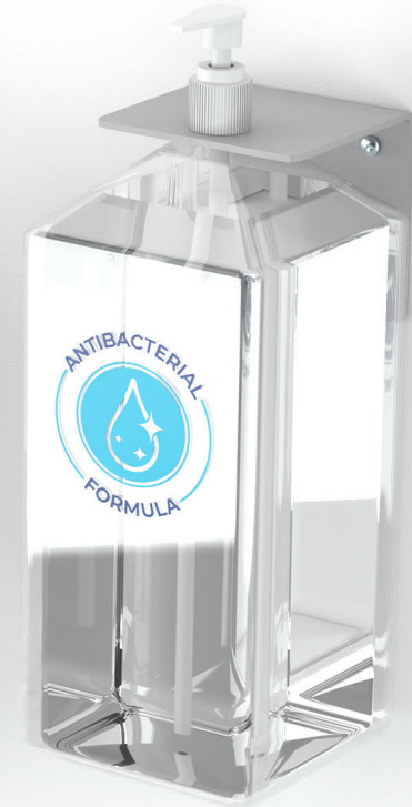
• Hand sanitizer bottle not included