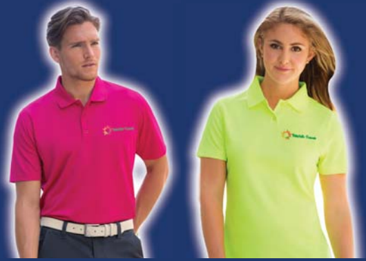
BEST SELLING PERFORMANCE POLOS