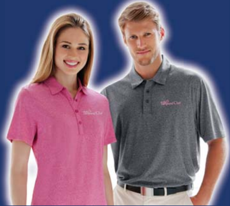
HEATHER PERFORMANCE POLO