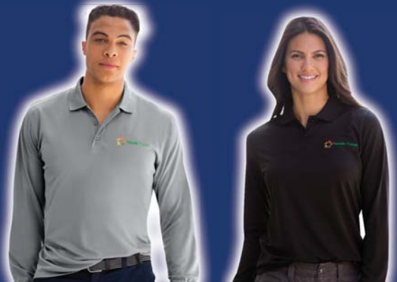
LONG SLEEVE MESH POLOS